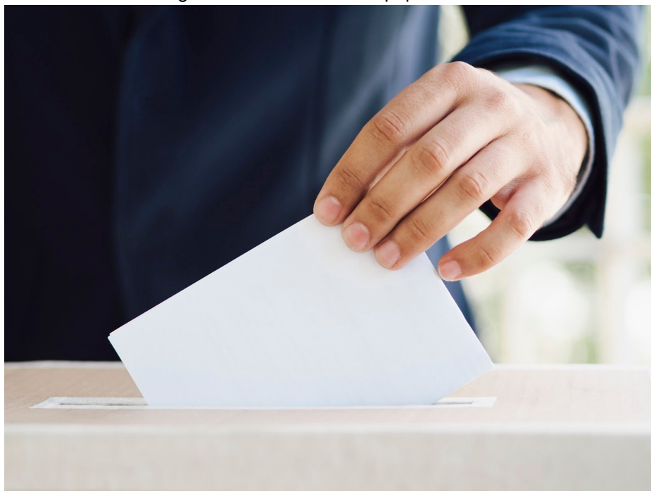
Figura 16: Mão colocando papel na urna