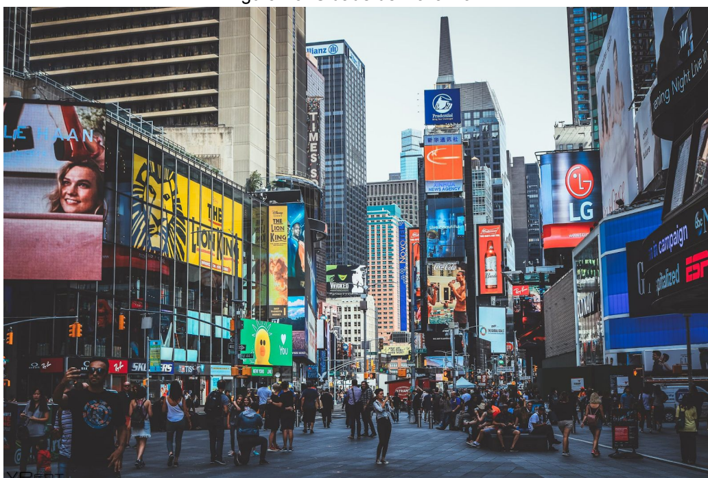
Figura 16: Cidade de Nova York.