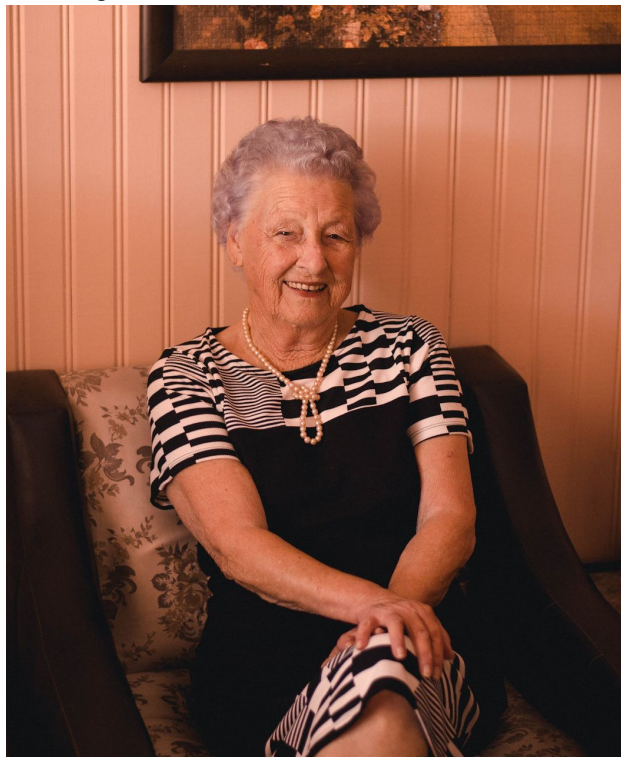
Figura 15: Senhora sentada em um sofá..